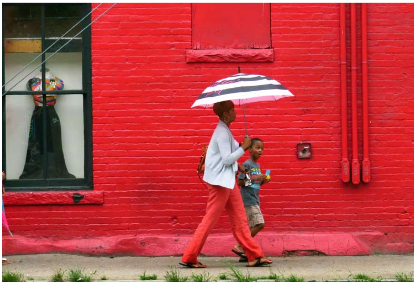
"Rainday," by Glen Lopez. Courtesy of the photographer.