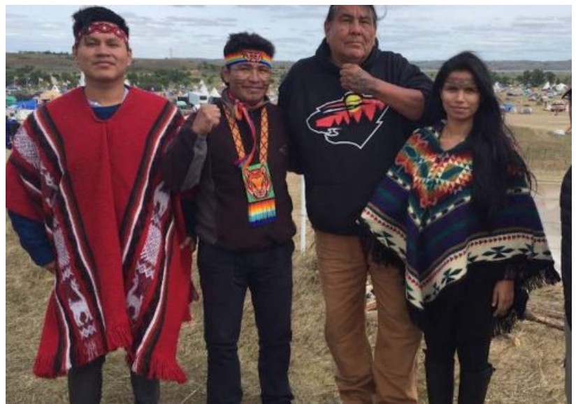
Tribal members from the Ecuadorian Amazon in Cannon Ball, North Dakota