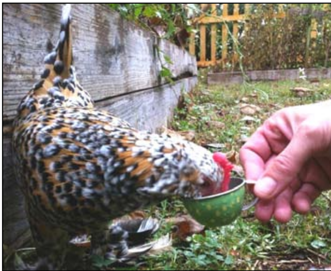
Sugar the Chicken.

This morning we dug a hole in the garden flower bed and set her in the ground. Yes, she may have been “just a chicken,” but we will miss her all the same. R.I.P. Sugar. ~